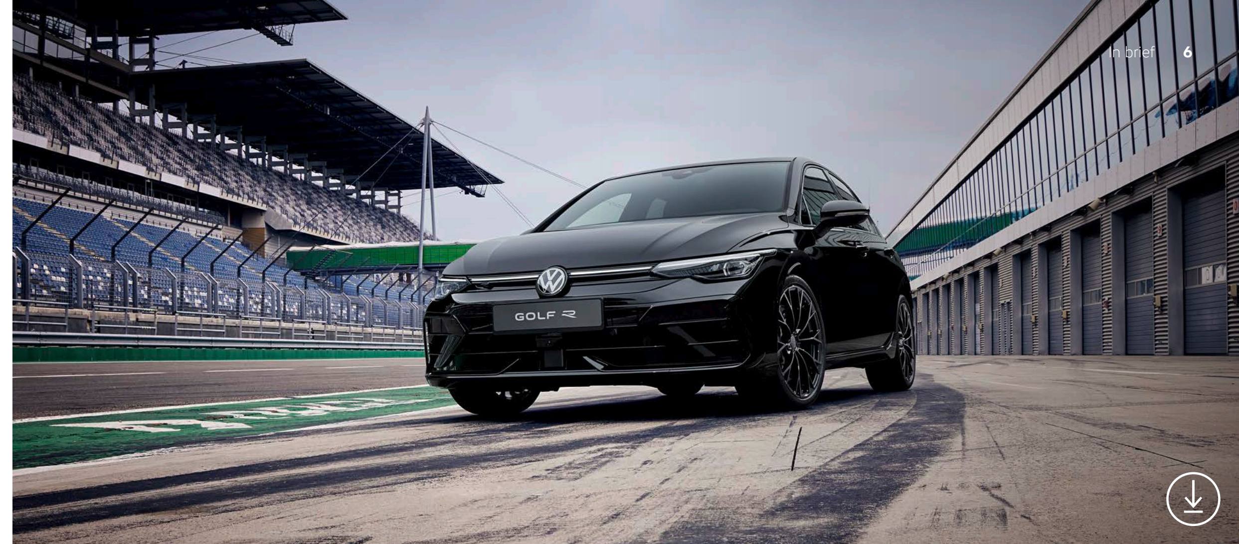
The Golf R Black Edition with Performance Package has a top speed of 270 km/h.

The debut of the new R models is another highlight in the long success story of the Golf R 1 . It began in the summer of 2002 with the legendary Golf R32 7 (177 kW/241 PS) – this car and its four successors have sold far more than 250,000 units so far. The 4MOTION all-wheel drive system and maximum performance are common denominators and can naturally also be found in the 2024 Golf R models. This is particularly evident in the example of the new Golf R Black Edition – an exclusive model that will be available to order straight away upon market launch. The Golf R Black Edition is designed to have a completely dark look and has a top speed of 270 km/h 6 . It boasts features such as black 19-inch Estoril wheels (19-inch Warmenau forged wheel in black available as optional equipment), darkened Volkswagen badges and R logos, black R brake calipers with a dark R logo and black tailpipe trims. The new,