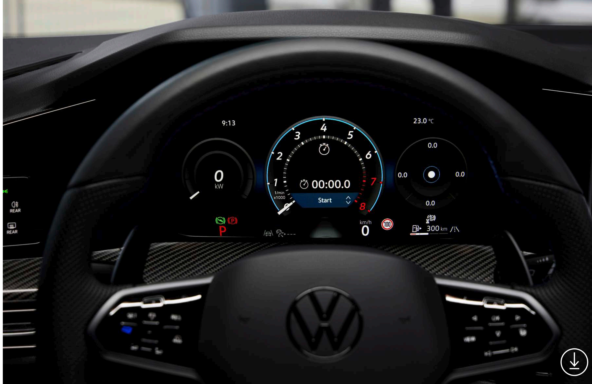
The new GPS lap timer can also be used to measure split times.