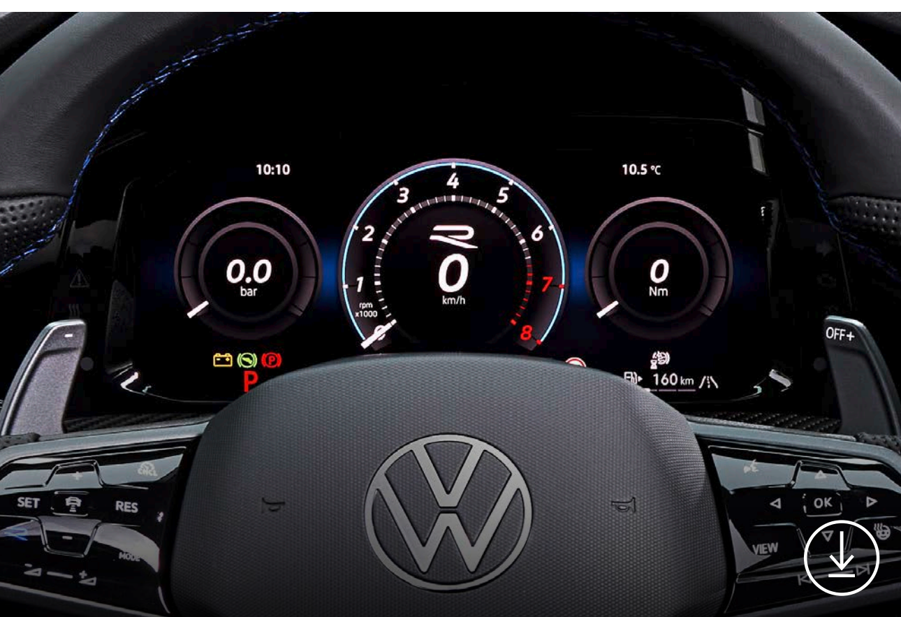
The new GPS lap timer of the Golf R.

darkened IQ.LIGHT LED matrix headlights are also standard. Its standard equipment also includes the otherwise optional Performance package; in addition to the higher top speed, it offers two additional modes for motorsport enthusiasts who also drive on tracks away from normal road traffic: Drift and Special. The latter was specifically adapted to the Nürburgring Nordschleife. Additional downforce is provided by a larger roof spoiler through which the air flow is routed. The Performance package also includes the GPS lap timer and the G-meter. The boundaries between series production and motorsport are broken down here in a fascinating new level of performance.