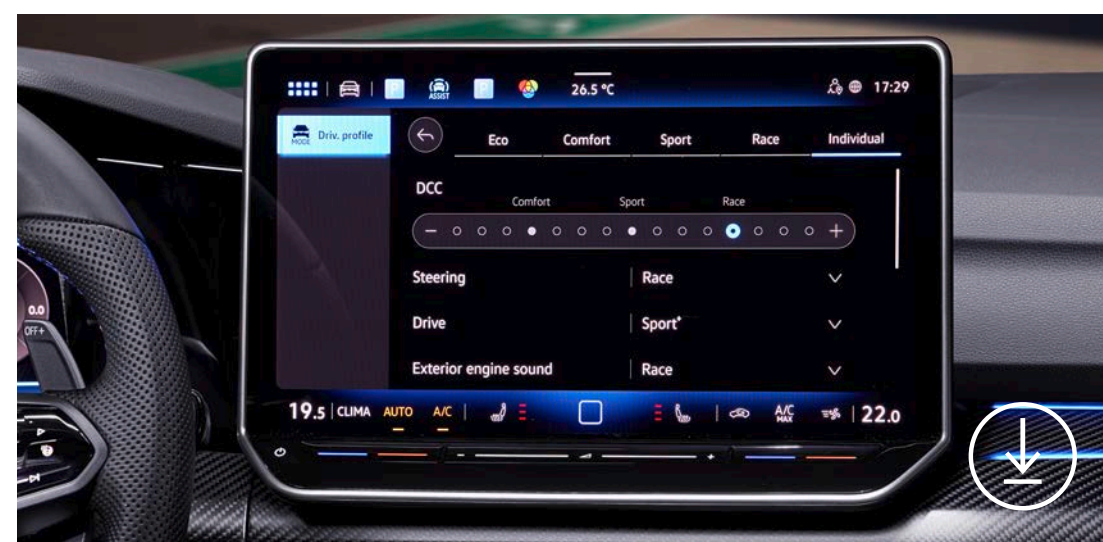
The DCC running gear can be adjusted individually.

Individual ESC control The driver can deactivate ESC by means of the vehicle menu. When starting the Golf R and Golf R Variant, the ESC is always active as a full system. After this, the ESC can be adapted in two stages: in ESC Sport mode, the ESC thresholds and TCS slip thresholds are increased to reduce the intensity of interventions. In ESC Off mode, experienced drivers can additionally deactivate ESC altogether for all driving situations. However, Front Assist and the swerve support function reactivate the full ESC system in an emergency.