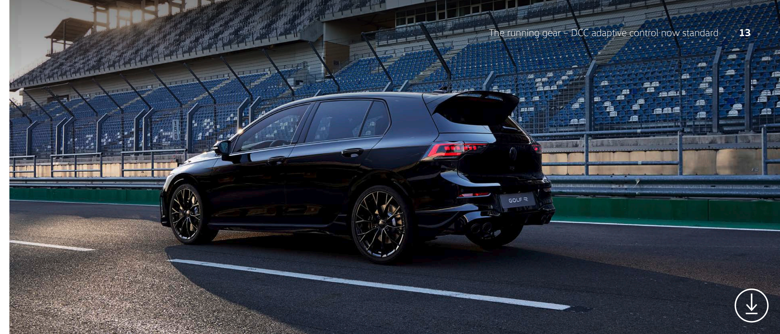
The exclusive Golf R Black Edition 5 .

DCC 3 adaptive chassis control The DCC adaptive chassis control – which in Germany is now fitted as standard in the Golf R and Golf R Variant – continuously reacts to the road surface and driving situation while taking into account various elements including steering, braking and acceleration. The lateral dynamic components of the DCC running gear are coordinated and further optimised by the Vehicle Dynamics Manager. Using the set driving profile, the driver can influence the reduction in body motion as desired. The required damping is calcu-