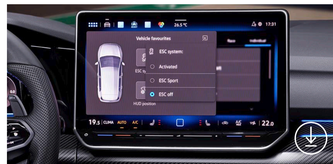
The driver can adjust the ESC to the respective situation.