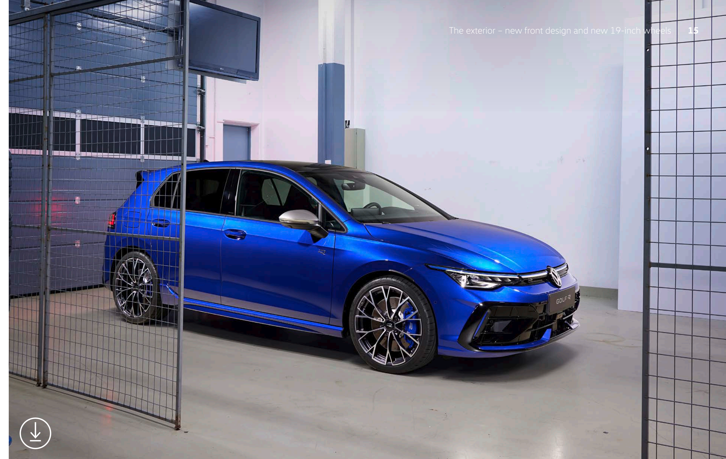
The front bumper and LED headlights have been redesigned.

Silhouette in R design At the sides, the new Golf R and the Golf R Variant 2 are distinguished from all other models in the product line by the exterior mirror housings in matt chrome (with R logo projection as part of the exterior background lighting), the R logo on the doors below the exterior mirrors, side members with a specific design, silver-anodised roof rails on the Golf R Variant and an independent wheel rim range. For the first time, the hub caps on the 18- and 19 4 -inch wheels feature the R logo instead of the Volkswagen badge.