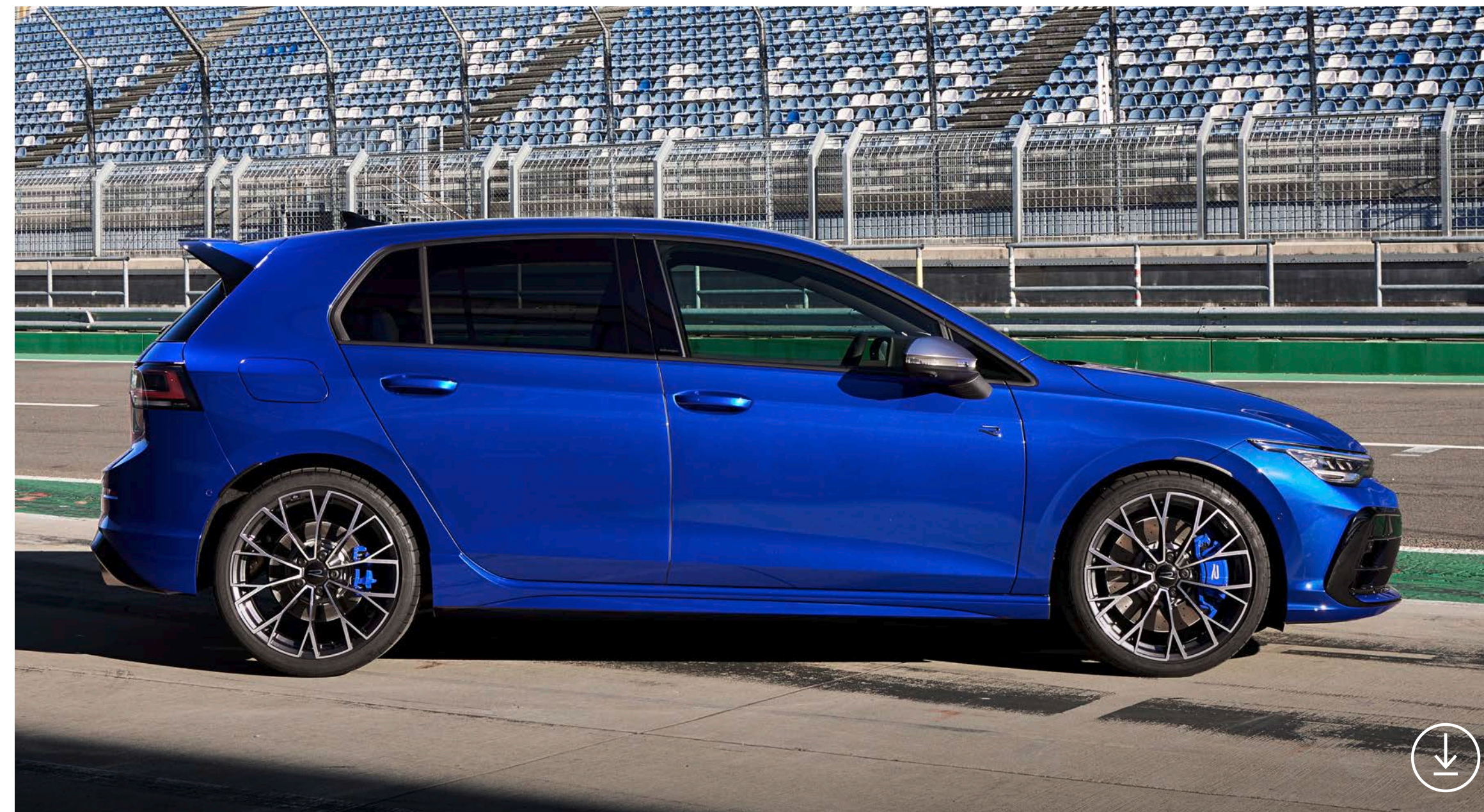
The Golf R with the optional 19-inch Warmenau forged wheels.

and the 4MOTION all-wheel drive system with R-Performance torque vectoring.