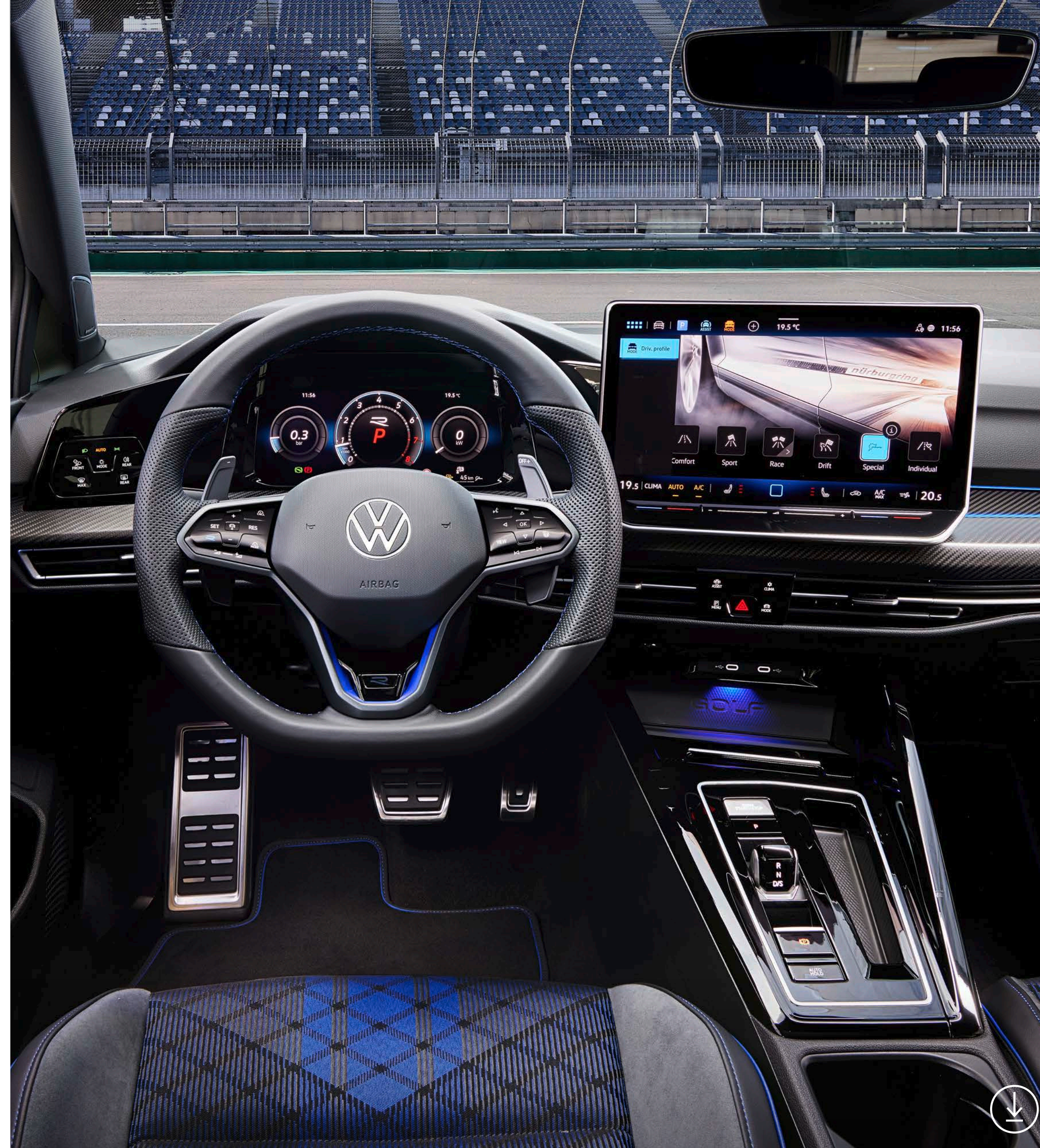
The Golf R with the Digital Cockpit Pro and new infotainment system display.

Extended Digital Cockpit Pro The new Golf R models are equipped with the enhanced Digital Cockpit Pro as standard (display diagonal: 26 cm/10.2 inches). The driver can use corresponding buttons on the multi-function steering wheel to set up different basic graphic configurations (information profiles): in addition to the classic views from other models in the product line, the Digital Cockpit Pro in the Golf R 1 offers an enhanced Sport skin, featuring a central round rev counter with an R-specific design including the R logo. A three-dimensional layout – the R view – with numeric fields is additionally available. As an exclusive feature, there is a horizontal rev counter at the top edge of the display. The scale for this flat, horizontal display ranges from 0 to 8 (equivalent to 0 to 8,000 rpm). In models with the Performance package, the display provides gear-shift recommendations when manual DSG mode is activated. In manual DSG mode, the driver either uses the shift-by-wire buttons on the centre console or the paddles on the steering wheel to perform manual gear shifts. Particularly when driving on race tracks, the gear recommendation provides valuable assistance, since automatic upshifts are intentionally deactivated in manual mode in the Special and Drift driving profiles. New functions in the Digital Cockpit Pro in conjunction with the Performance package include a GPS lap