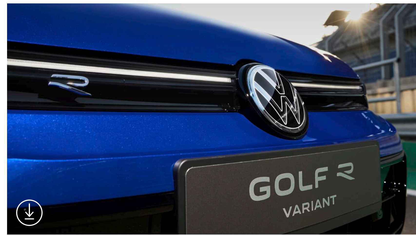
The Golf R 1 with illuminated VW logo.