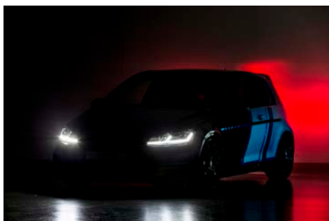
Still secret: the Wörthersee GTI 2017. The premiere is on Wednesday, May 24 in Carinthia (Austria)